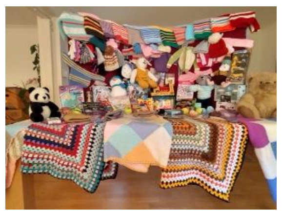
Photo shows some of the useful goods, wonderful knitted goods and cuddly toys that were donated.

toys, workshop items, knitting needles and other craft items. Alison, Rita and Ruth have spent a day busily packing up the donated items all ready for transportation to Moldova. A fantastic total of twenty three banana boxes and three suitcases were packed ready for transportation to Moldova.