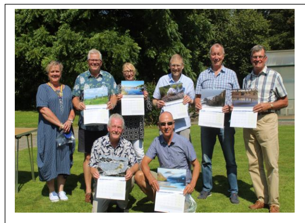
The Lucky Winners.