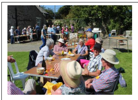
Enjoying the BBQ !!