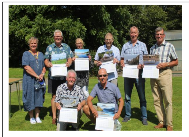
The Lucky Winners.